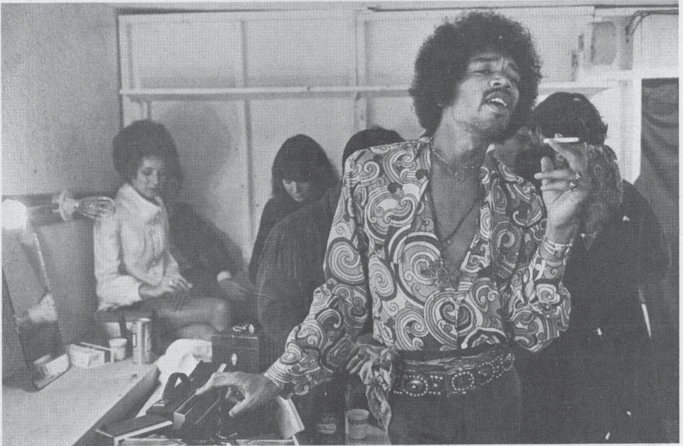
Jimi Hendrix at Winterland