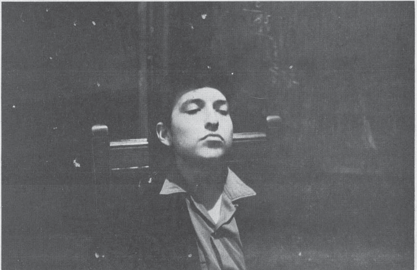
Bob Dylan at Town Hall N.Y.C., 1962