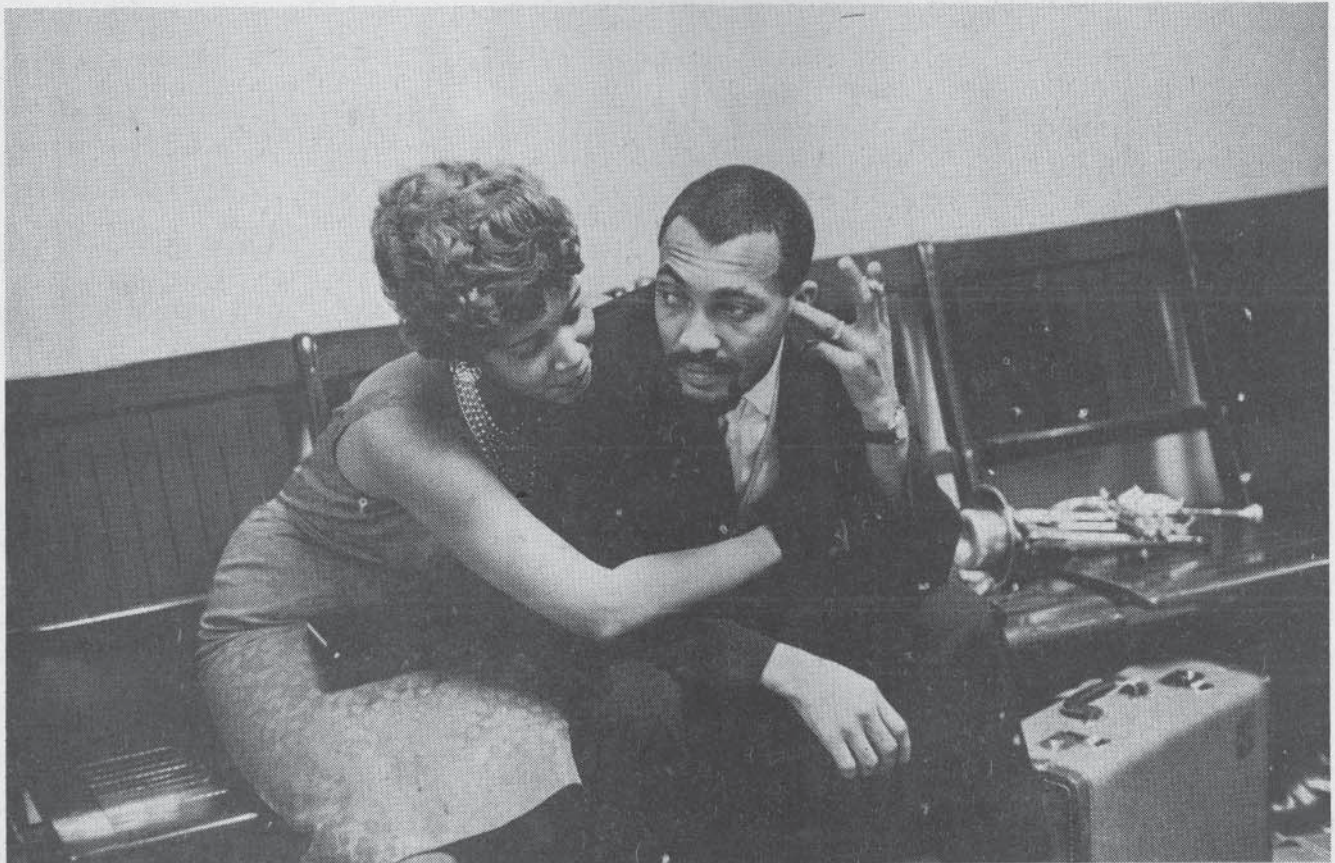
Hank Crawford at Oakland Civic Auditorium, 1960